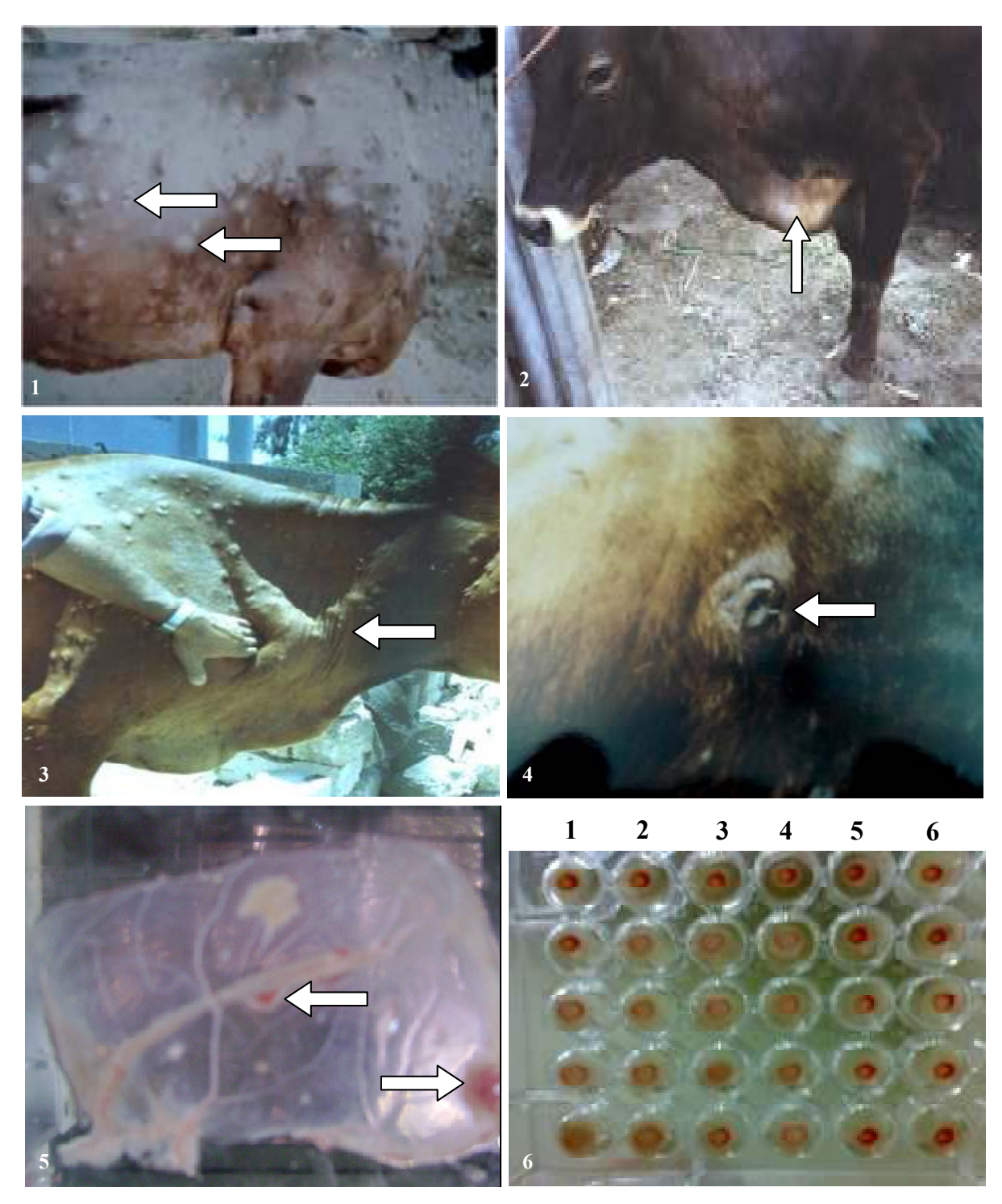
Fig. 1: Several cutaneous skin nodules with variable sizes in a diseased cow with LSD during 2006 outbreak.

Fig. 2: Sever edema was recognized in the dewlap of a diseased cow with LSD during 2006 outbreak.