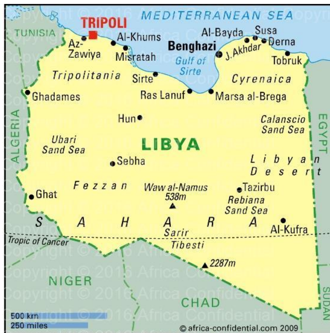
Fig. 2. Location of the study districts and underground water bodies/(3 districts in Libya) ( www.google.map ).