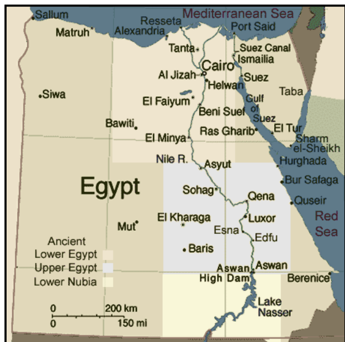
Fig. 1. Location of the study districts and underground water bodies/3 districts in Egypt ( www.google.map ).