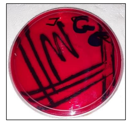
Fig.2. Characteristic Salmonella colonies on XLD Agar

Table 2. Clinical data of the chicken flocks where positive Salmonella isolation was evident.